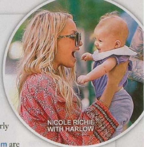
NICOLE RICHIE WITH HARLOW

to be "her first high heels." $35, heelarious.com.